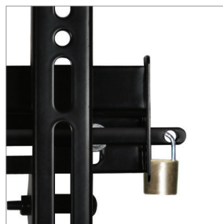
Locking bar for secure installation (padlock not included)