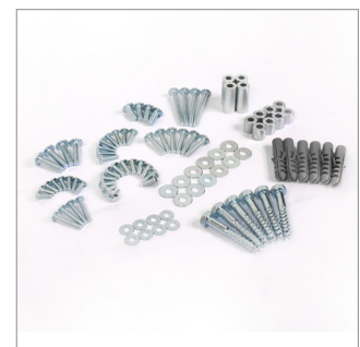
All fixings and mounting hardware included