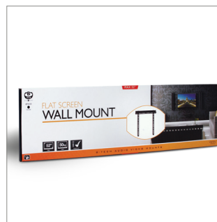
Supplied in retail packaging, ideal for the consumer market