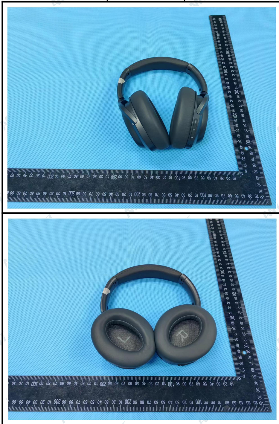
The photo of the sample