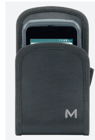
Holster size S Ref. 031001