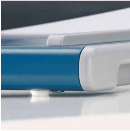
Non-slip rubber feet for firm standing