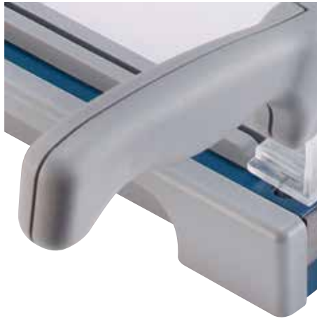
Ergonomically shaped handle to prevent tired hands while cutting