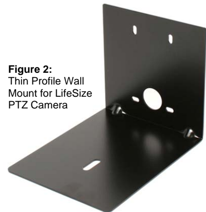
Figure 2: Thin Profile Wall Mount for LifeSize PTZ Camera

Please see the Vaddio website at http://www.vaddio.com for the Vaddio Statement of Warranty for all Vaddio Products. The Statement of Warranty covers the policies and procedures of the Hardware Warranty, Exclusions, Customer Service, Technical Support, Return Material Authorizations (RMA), Voided Warranty, Shipping and Handling and Products Not Under Warranty. The Vaddio Warranty Statement supercedes all other published warranty statements in content and coverages. Vaddio Technical Support can be contacted through the Vaddio website or through e-mail support at mailto:support@vaddio.com .