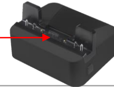
Sealed I/O Connector comes with rugged frame