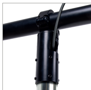
Integrated cable management for a neat and tidy installation