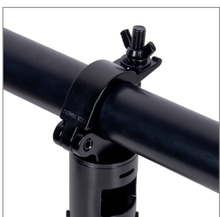
Fits truss systems from 42mm up to 50mm