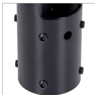
Grub screws allow micro-adjustment of the pole angle once mounted