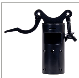
Wing-nut fixing allows quick release of the clamp from the pole