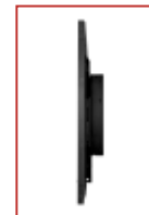
Clean profile hides components from view