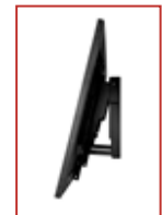
Media device access