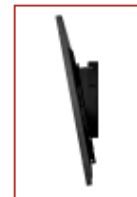
Continuous tilt from 0-10 degrees