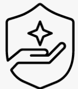
3-year pickup and return UM963E