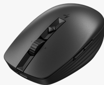
HP 710 Rechargeable Silent Mouse 6E6F2AA