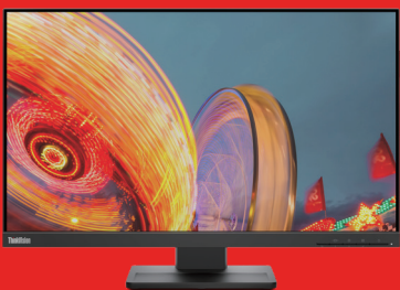
Accurate colors with 99% sRGB color gamut