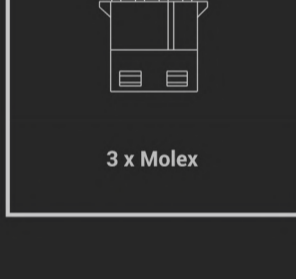
3 x Molex