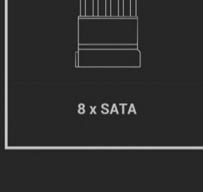
8 x SATA