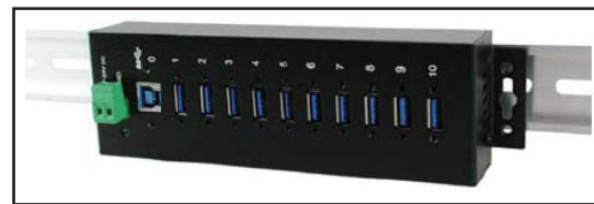
Din Rail Mounting

This manual may make reference to trademarks, registered trademarks, and other protected names and/or symbols of third-party companies not related in any way to StarTech.com. Where they occur these references are for illustrative purposes only and do not represent an endorsement of a product or service by StarTech.com, or an endorsement of the product(s) to which this manual applies by the third-party company in question. StarTech.com hereby acknowledges that all trademarks, registered trademarks, service marks, and other protected names and/or symbols contained in this manual and related documents are the property of their respective holders.