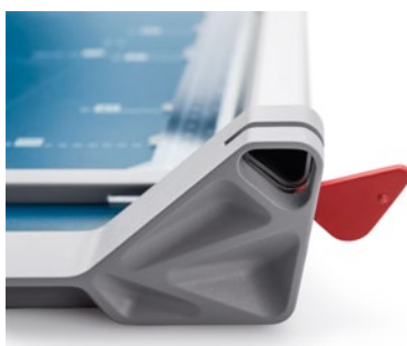
Dahle 508 rotary trimmer (3rd generation) - replace cutting heads easily with undetachable locking mechanism