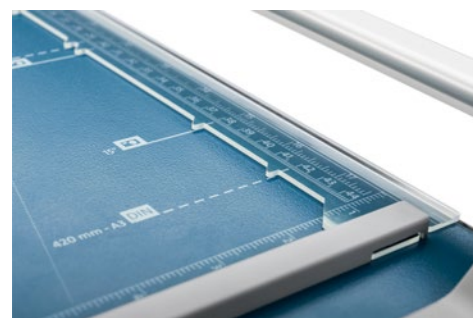
Dahle 508 rotary trimmer (3rd generation) - practical format lines and pressure clamp with markings make it easier to align the material to be cut