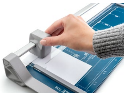
Dahle 508 rotary trimmer (3rd generation) - simple to use with two fingers thanks to improved cutting head ergonomics