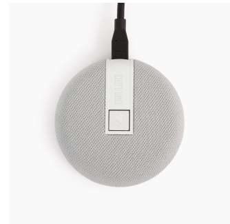
Meeting Owl 3 Required, Not Included

Expand the audio range of your Meeting Owl 3 by 8 feet (2.5 meters) by connecting to the Expansion Mic. Put a mic closer to participants so quieter and more distant voices can always be heard. Seamlessly manage meetings with a mute button at your fingertips. Easy micro-HDMI connection and optional mounting bracket included. Designed to work exclusively with the Meeting Owl 3 for optimal performance and complementary design. Not compatible with Meeting Owl Pro or Meeting Owl original. Owl Labs Expansion Mic. Type: Conference microphone, Microphone sensitivity: 72 dB, Microphone direction type: Cardioid. Connectivity technology: Wired, Device interface: Micro HDMI. Product colour: Grey, Control type: Buttons, Mounting type: Table. Power source: Micro HDMI. Width: 87 mm, Depth: 87 mm, Height: 28.5 mm