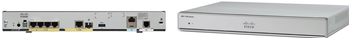
Figure 3. Cisco 1100-4P ISR with DSL, Back and Front View