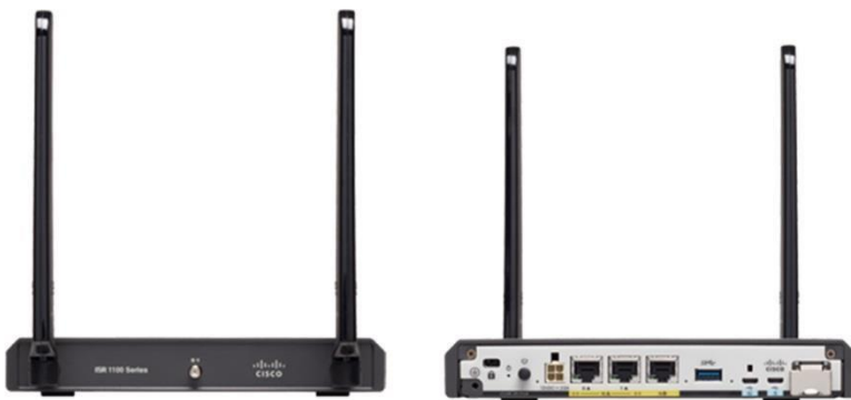
Figure 5. Cisco 1109-2PLTE with fixed CAT4 LTE