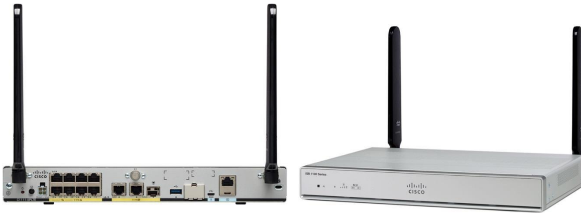
Figure 2. Cisco 1100-8P ISR with LTE Advanced, Back and Front View