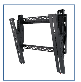
Fully adjustable +15/-2° tilt with Increl ok™

*This display size range is simply a guideline for product selection. Displays larger than the screen size range may still be compatible as long as they fall within the VESA® pattern and max weight of the Peerless-AV® product.