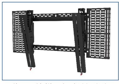
Shown with (2) optional ACC-UCM2 Universal AV Component Mounts