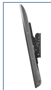
+15°/-5° of tilt for versatile viewing angles.