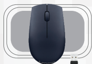
Lenovo 520 Wireless Mouse