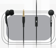
Lenovo 100 In-Ear Headphone