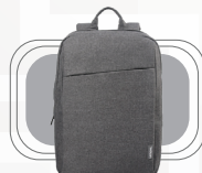
Lenovo 15.6" Laptop Casual Backpack B210

* Example of Lenovo Yoga catalogue naming convention