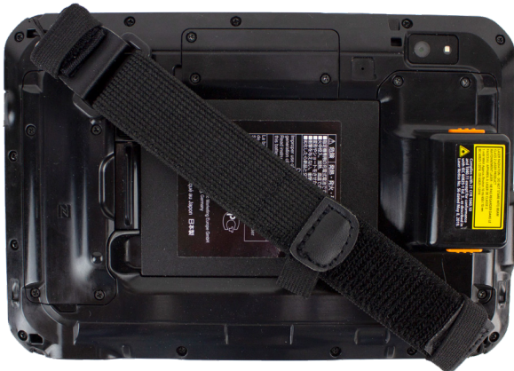
Shown in optimal orientation

PAN NA Part#: IN-S1HSTRP Manufacturer Part #: TBCS1HDSTP-P Sizes: Adjustable Accommodates: Gamber-Johnson vehicle docks