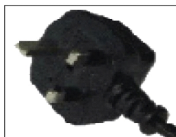
Images represent product style only. Switched unit shown.