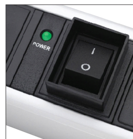
Shrouded Rocker Switch and LED Indicator