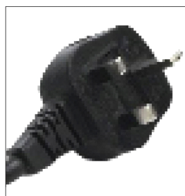
3 Pin BS1363 Plug