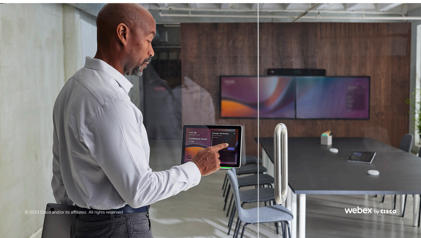
Figure 4: Room Navigator powering the Microsoft Teams Panel experience