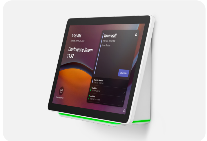
Figure 3: Room Navigator deployed as a native Microsoft Teams Panel

And when using the native Cisco solution for room booking, you can significantly simplify your deployment, lower total cost of ownership and ease management efforts by leveraging a single vendor to provide platform agnostic video collaboration devices, the underlying meeting service, the room control hardware, and the associated room booking software solution.