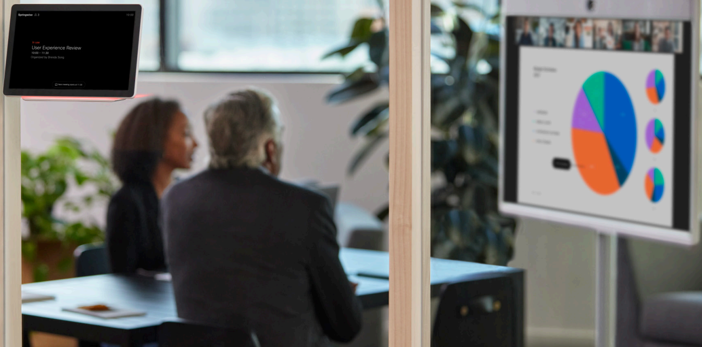
Figure 1: Cisco Room Navigator for Wall unit mounted on glass wall showing meeting room availability

Transform your workplace with simple and intelligent experiences while eliminating the friction from the employee journey. The wall-mount Cisco Room Navigator touch panel is designed to bring ease and convenience into modern workspaces by providing instant access to conference controls, smart room booking, room controls and third-party workspace applications.