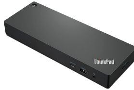
ThinkPad Universal Thunderbolt™ 4 Dock