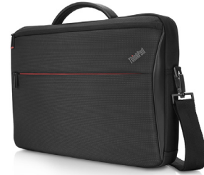
ThinkPad 14-inch Professional Slim Topload