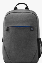
HP Prelude 15.6-inch Backpack 2Z8P3AA