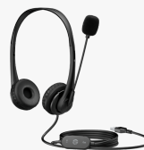
HP Stereo USB Headset G2 428H5AA