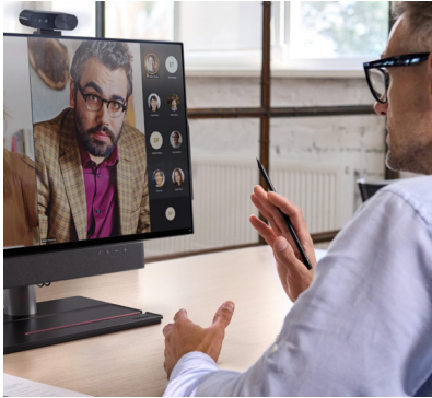
Executive desk, telehealth, remote learning, and phone booth