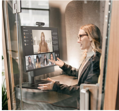
Virtual reception, hoteling, and hotdesking