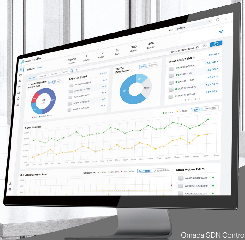
Omada SDN Controller