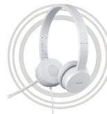
Lenovo 110 Stereo USB Headset