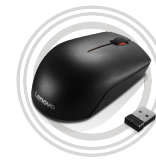
Lenovo 300 Wireless Compact Mouse