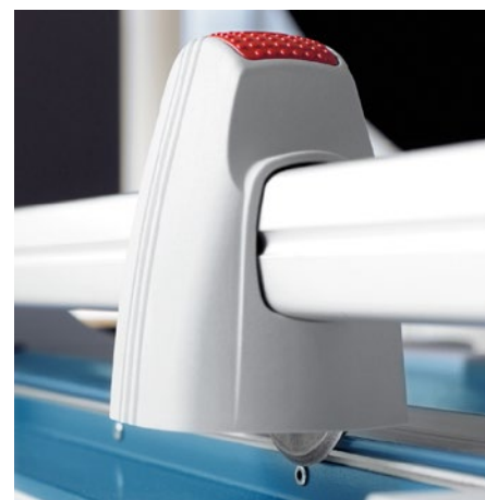
Circular blade in the sealed plastic housing provides maximum safety