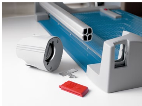
Easy-to-change cutting head to keep work processes running smoothly