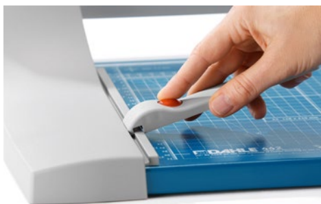
Adjustable backstop for quickly finding the right format - can be used on both scale bars