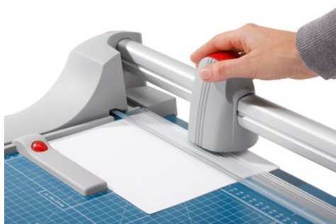
Ergonomic cutting head for convenient cutting-machine operation