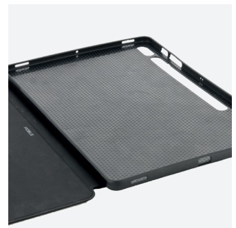
Flexible TPU case