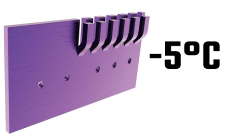
Optimized thermal performance

An anodic-coated heat sink keeps average components temperatures 5°C lower.