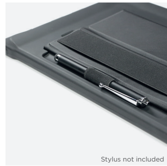
Stylus not included