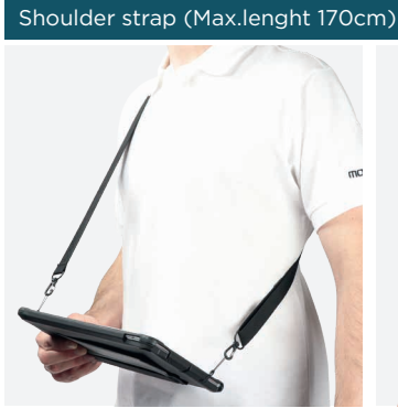
For typing in standing position