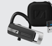
ADAPT Presence Grey UC