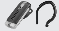
ADAPT Presence Grey Business