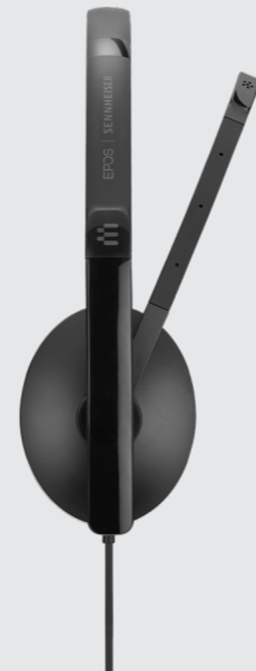
ADAPT 100 Series On-ear, single-sided and double-sided wired headset