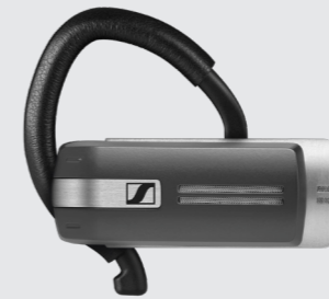
ADAPT Presence Series In-ear headset Wireless Bluetooth®