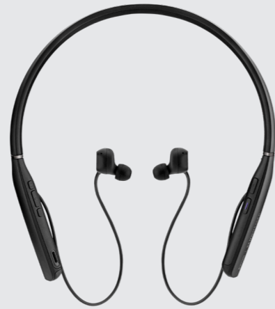
ADAPT 400 Series In-ear neckband headset Wireless Bluetooth®