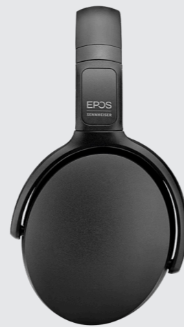
ADAPT 300 Series Over-ear, headset Wireless Bluetooth®