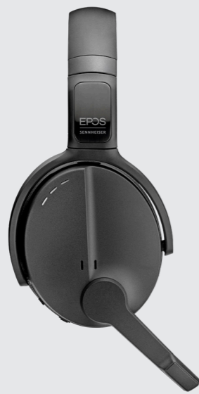
ADAPT 500 Series On-ear, headset Wireless Bluetooth®