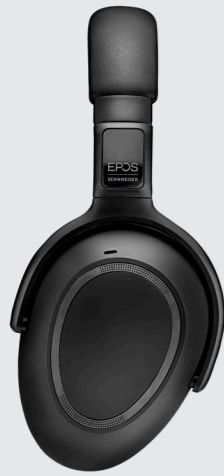
ADAPT 600 Series Over-ear, headset Wireless Bluetooth®