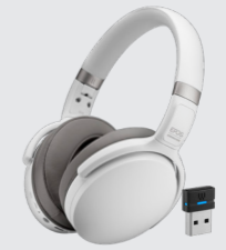
ADAPT 360 white