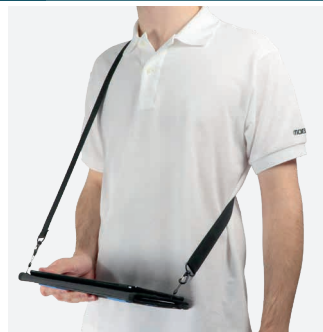
For typing in standing position