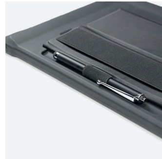
*Stylus not included