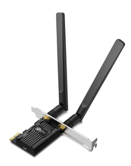
Bluetooth 5.2 Compatible

TP-Link AX1800 Wi-Fi 6 Bluetooth 5.2 PCIe Adapter. Internal. Connectivity technology: Wireless, Host interface: PCI Express, Interface: WLAN / Bluetooth. Maximum data transfer rate: 1800 Mbit/s, Top Wi-Fi standard: Wi-Fi 6 (802.11ax), Wi-Fi band: Dual-band (2.4 GHz / 5 GHz). Product colour: Black